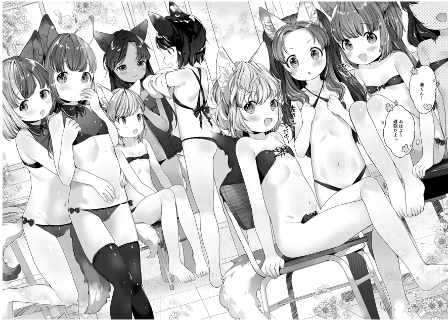
Figure 11: Lion's Pride