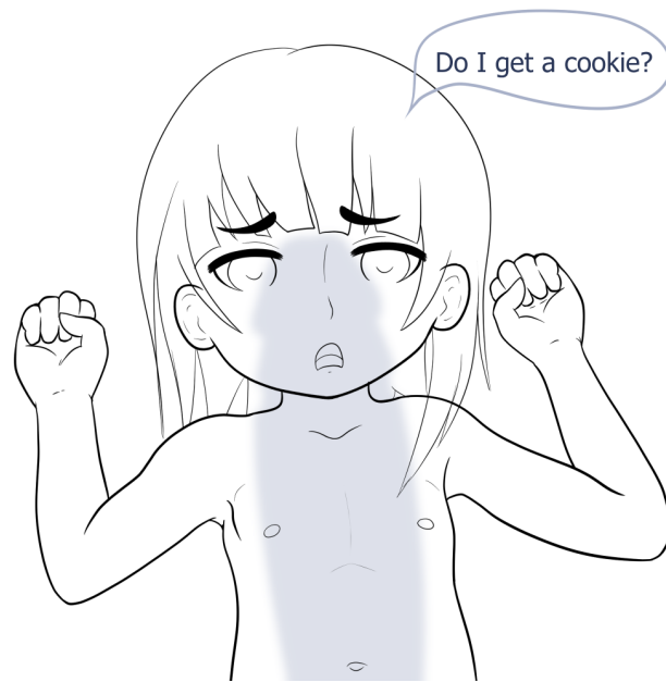
Figure 2: Maurice's cookie

some of my coworkers had managed to show little Maurice that it's not as yucky as they think. But one look at her still open flower was enough to reject her offer.