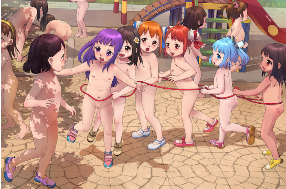
Figure 1: Toddler playground

“Yep, I not wet my pull-pulls two whole days, so Mommy told me I could have them if I use potty.”